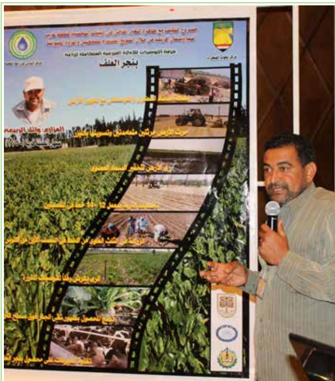
Egyptian farmer presents his experience at a seminar which targeted wide scale participation, policy makers, NGO and administrators.

and perennial forages/crops were identified for each country. Work then focused on building the capability of the national facilities for local seed production for scaling-up. Throughout the project, intensive work was carried out with the farmers to present these forage production packages and build up local farmer demand, plus ensure that farmers are able to multiply adapted crops like barley, sorghum, pearl millet and quinoa. Hence, farmers were able to advance seed production while also improving forage processing and storability which enhanced their income.