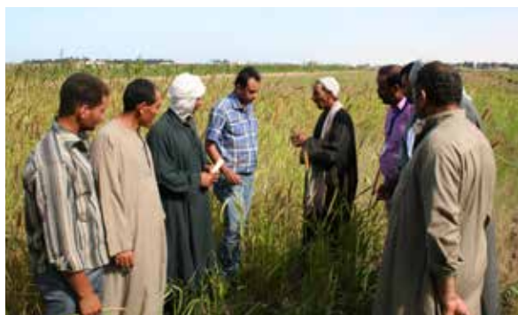
Project activities include training farmers to work as facilitators in their community.