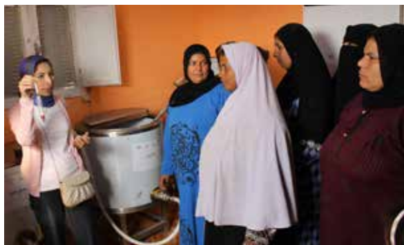
A main project objective is enhancing rural women's knowledge in marginal lands. Women in North Sinai were trained in on-farm forage production and utilization techniques, including milk processing and the hygienic and economic production of dairy products.

Thematic Area: Climate Change Impacts and Management