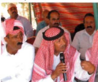
A farmer makes his point.

As they say, the proof of the pudding is in the eating, and Jordan's extension agents are hopeful that the enthusiastic response of the farmers already subscribed to the project will spread throughout the country.