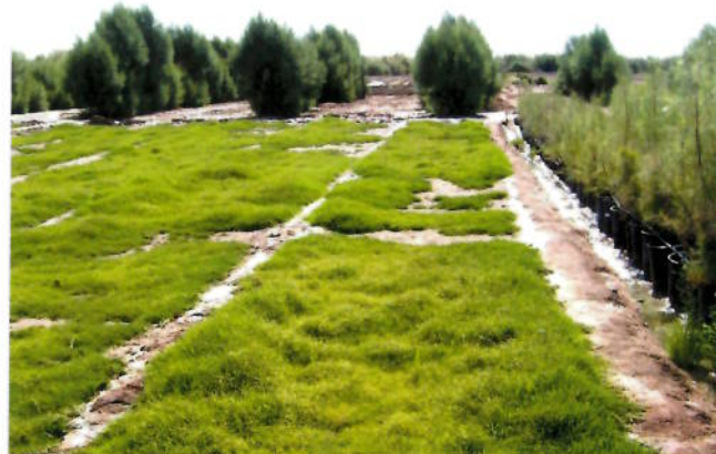
A bit of everything: ODE's nursery includes grasses, shrubs and trees.

The project site is situated in the Mexican Colorado River Delta between the US border and the Gulf of California, one of the driest regions on the globe with high evaporation and effective rainfall close to zero. During the past century, the Colorado River,