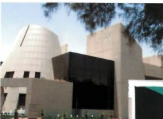
Strengthening relations: KISR and ICBA are the two premier institutions for biosaline agriculture in the Gulf region.