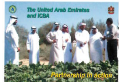
Partnership in action

ICBA Annual Report 2005 (1425-26H). 120 pages. The Arabic translation is in progress.