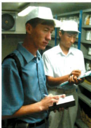
The Uzbekistani students in the ICBA Genebank.