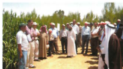
Farmers and extension staff inspecting the robust growth of pearl millet cultivated with saline groundwater.