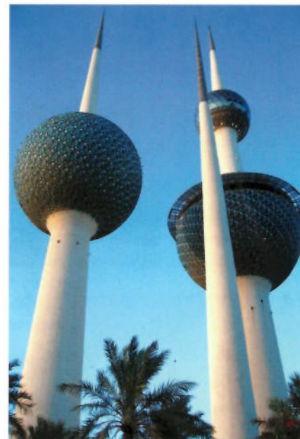
Kuwait City, the venue of the IDB's 31st Annual Meeting.