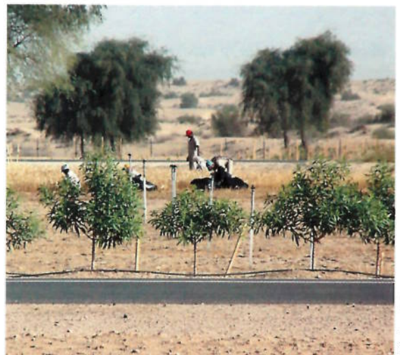
Windbreaks on BAC's Al Ruwayyah station.

Any organization is faced with making strategic choices, which are driven in part by the nature and scope of its "market" (the problem of salinity in irrigated agriculture, in the case of BAC), its "client base", its core strengths, its "competitors" or "alternative suppliers", and many other factors. This is the process that BAC has undertaken in developing its strategic plan for the next five years. The following paragraphs outline some of the considerations that have shaped this plan.