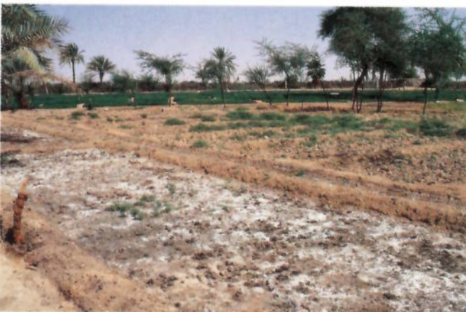
Salt-encrusted plots at Al Ruwayyah, Dubai.

Saline and brackish water resources are far more abundant than fresh water and little used at present. Bringing these resources into sustainable productive use will offer opportunities to increase food