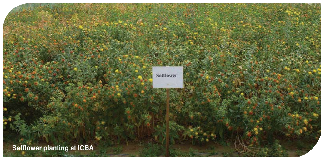
Safflower planting at ICBA

Safflower produces gorgeous flowers of various colors that give it high ornamental value. Though most safflower growing countries cultivate