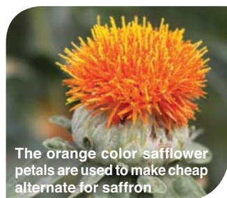
The orange color safflower petals are used to make cheap alternate for saffron

in China, India, Iran and the USA has been done to select the spineless cultivars, which is necessary for successful floriculture. However, more breeding effort is required to evolve improved spineless safflower varieties.