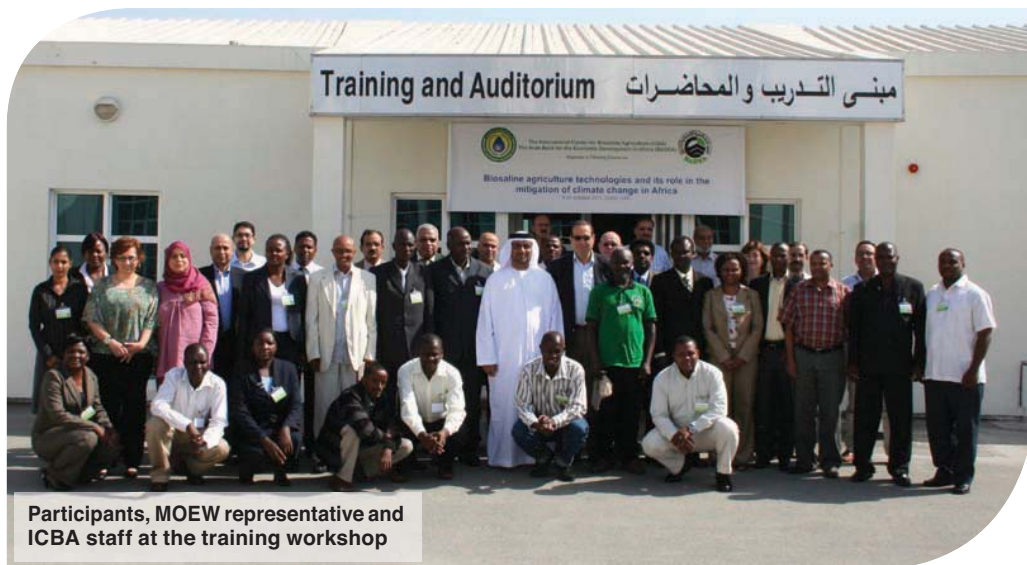
Participants, MOEW representative and ICBA staff at the training workshop

This two-week course was the third in a series of capacity development programs for African countries organized by ICBA since 2007. These programs are funded by the Arab Bank for Economic Development in Africa (BADEA) which provides financial and technical