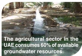
The agricultural sector in the UAE consumes 60% of available groundwater resources

ICBA expanded recently its research on existing irrigation water use in the United Arab Emirates in order to recommend to decision makers and planners strategies for sustainable irrigation development in different agro-climatic zones of the UAE. The agriculture sector in the UAE is the main consumer of water (60%), followed by the domestic and industrial (32%) sectors with the remaining 8% being wasted or lost. Groundwater, which has been used extensively for agriculture, has long been over-exploited, resulting in falling well yields and increasing water salinity. These constraints, exacerbated by increasing soil salinity, have resulted in rendering many areas incapable of supporting cultivation of anything other