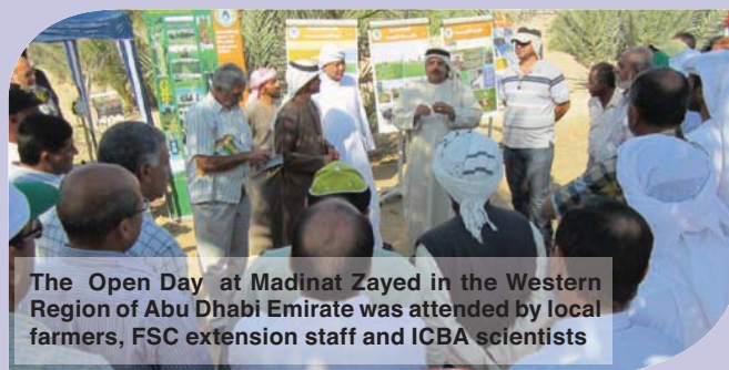
The Open Day at Madinat Zayed in the Western Region of Abu Dhabi Emirate was attended by local farmers, FSC extension staff and ICBA scientists

In 2011, ICBA established three model farms to introduce alternative forage production systems after the use of the water-thirsty Rhodes grass was stopped. Since then some non-conventional, salt-tolerant shrubs, trees and grasses have been planted under high salinity conditions (i.e. water salinity exceeding 15 \text{ dS m}^{-1} ; 11,000 ppm). In addition, a number of annual crops that have dual potential (as crops and as forages) have also been introduced in these model farms. To demonstrate efficient water use in irrigation, selective modern irrigation