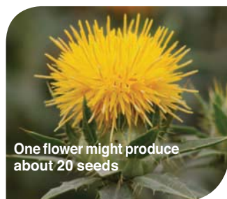
One flower might produce about 20 seeds

safflower for its oil, it has huge scope to be used for fresh-cut and dried flowers. In Europe, where safflower is grown mainly for ornamental purposes, cut-flowers worth millions of dollars are sold every year. It is possible to introduce it as an ornamental in other parts of the world where it is grown mainly as an oilseed crop. Some work