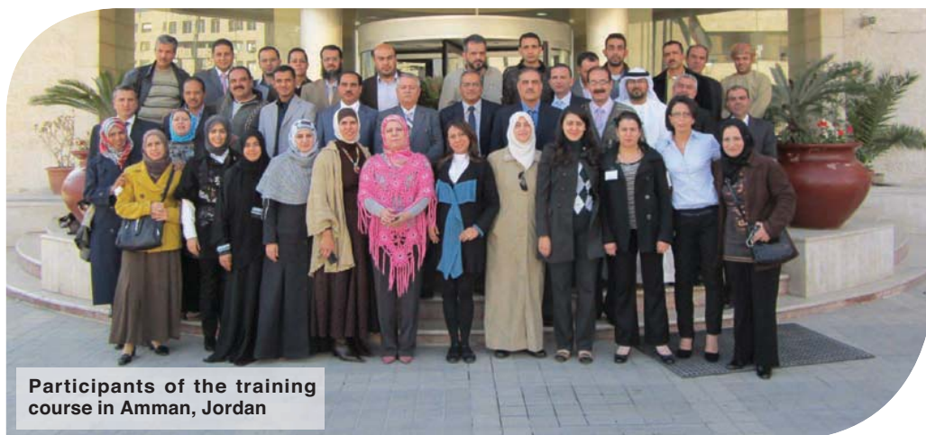
Participants of the training course in Amman, Jordan

Thirty-one participants from 14 Arab countries: Jordan, UAE, Bahrain, Tunisia, Algeria, Syria, Iraq, Oman, Palestine, Kuwait, Lebanon, Egypt, Morocco and Yemen attended the course. The course was conducted as part of the activities of the project on The safe use of treated wastewater in agriculture