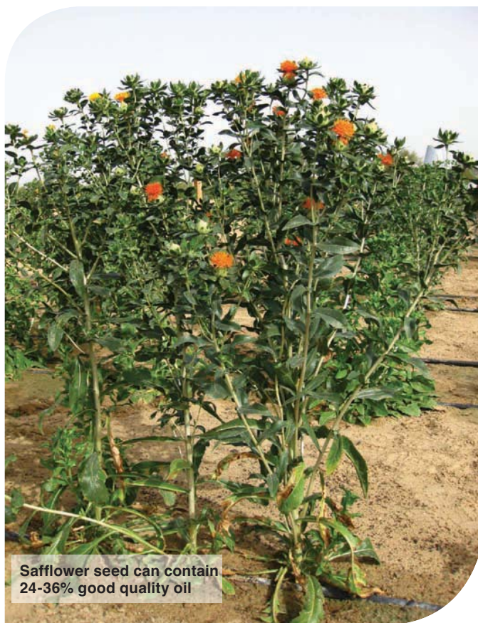
Safflower seed can contain 24-36% good quality oil

Safflower grows well in relatively deep and well drained soils. Sandy loam soil with good water holding capacity is considered to be best for the crop. At germination, the optimum temperature is 15.5°C, while at flowering time 24-32°C will give the higher seed yield. The seed rate is 10-25 kg ha -1 with 45-60 cm of row spacing. In arid lands the seed yield is about 500 kg ha -1 while in