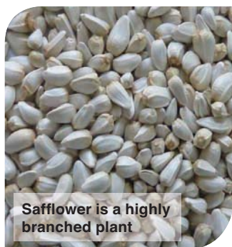
Safflower is a highly branched plant

irrigated areas it may produce more than 1000 kg ha -1 , but with improved agronomic practices the yield can be doubled. Mexico is the biggest producer of safflower seed followed by India which has the largest area under safflower cultivation. The United States of America, Kazakhstan, Ethiopia and China are other important safflower-growing countries.