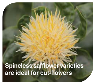
Spineless safflower varieties are ideal for cut-flowers