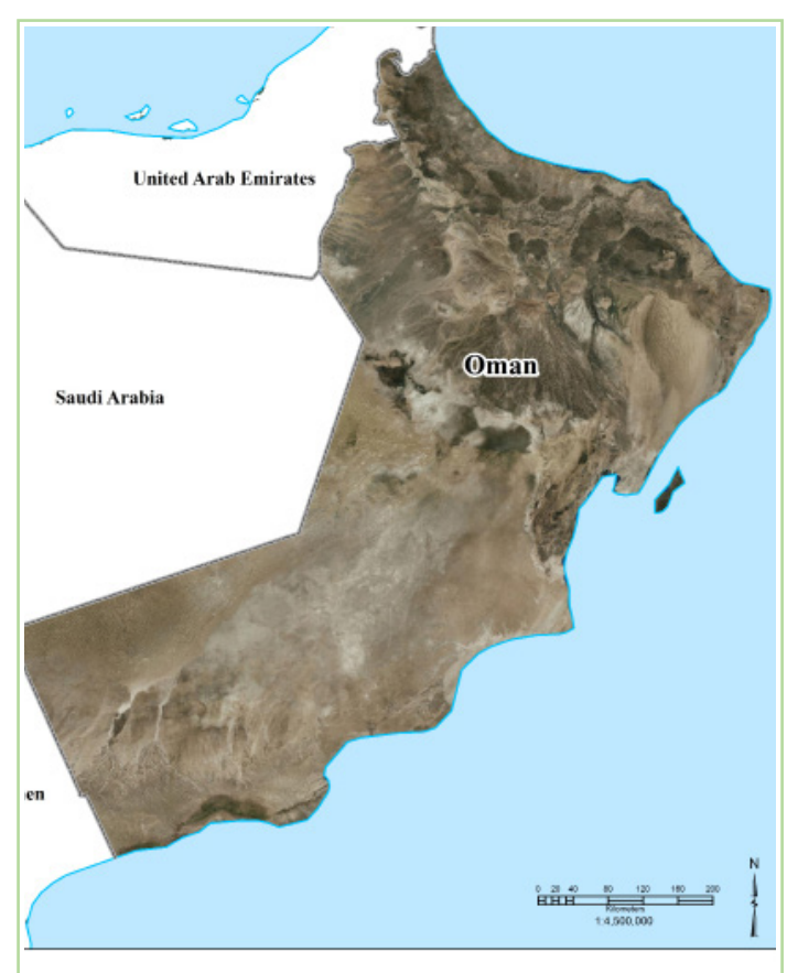
The Oman Salinity Strategy provides recommendations for improving agricultural production systems in the Sultanate of Oman through efficient and sustainable use of the country's natural resources.

Each measure was separately analyzed and ranked in terms of its effectiveness. Subsequently, all of the tactical measures were incorporated into an economic optimization model that looked at various scenarios and determined the costs and benefits compared with the 'business as usual' (BAU) baseline. The analysis clearly demonstrated that the best option to reduce agricultural water use is to employ a combination of tactical measures, which together form the proposed OSS.