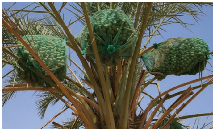
Date palm trees irrigated with saline water

A crop of economic and cultural significance to the host country and in fact to the entire region is the date palm ( Phoenix dactylifera ). Building on its research into date palms to determine the agronomic and yield characteristics of local UAE and imported Saudi varieties, in 2010 ICBA tested two date palm varieties (Khalas and Khenizi) with two mycorrhizae and two fertility treatments over four salinity levels of irrigated water. As date palms are often grown under saline conditions (a major concern for plant growth), ICBA researchers are determining how well mycorrhizal symbioses could enhance their survival and growth. In general, the symbiosis confers numerous benefits to host plants including improved plant growth and mineral nutrition, and tolerance to diseases and stresses such as drought, temperature and salinity. Date palms, possessing a coarse and limited root system, depend highly on mycorrhizae symbioses for water and nutrient uptake.