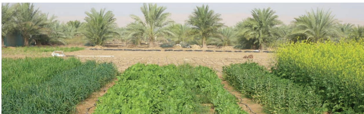
Initiating preliminary screening plots at farmers' fields

The FSC was established by the Abu Dhabi Food Control Authority (ADFCA) in 2009 as an intermediary between ADFCA and the farming community to achieve efficient integrated farming systems (including livestock) along with forages, vegetables and date production. The FSC also intends to reduce water usage in agriculture by up to 40% over existing levels through changes to the cropping patterns, adoption of improved water application techniques; and the updating of old and inefficient on-farm water systems. In the long-term the FSC seeks to improve marketing strategies for existing and new production systems and provide an education resource for farmers on agriculture, risks and compliance issues.