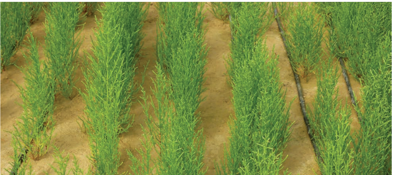
Salicornia experiments at ICBA Research Station

In another project within the UAE, researchers at the Masdar Institute (MI), along with several companies like Boeing, Etihad Airways, and UOP Honeywell, are keen to evaluate the potential of growing Salicornia with sea water for use as a biofuel and maintenance of CO 2 equilibrium. A halophyte that grows in salty waters, the seeds of Salicornia are an abundant source of biofuel. Given ICBA's rich experience in the evaluation of genetic material and optimizing different types of production systems, MI has agreed on a collaboration to evaluate the potential of growing Salicornia in the UAE at seawater salinities, in addition to testing different agronomic characteristics. Preliminary trials are being conducted at ICBA followed by field trials on the coastline of Abu Dhabi. In 2010 ICBA surveyed and rejected one of the islands as a potential trial site. Although Salicornia can be productive at sea water strength, it is always preferable for it to be located at a coastal site where the soil is sandy, thus ensuring free drainage to maintain a salinity balance between the soil and the sea water.