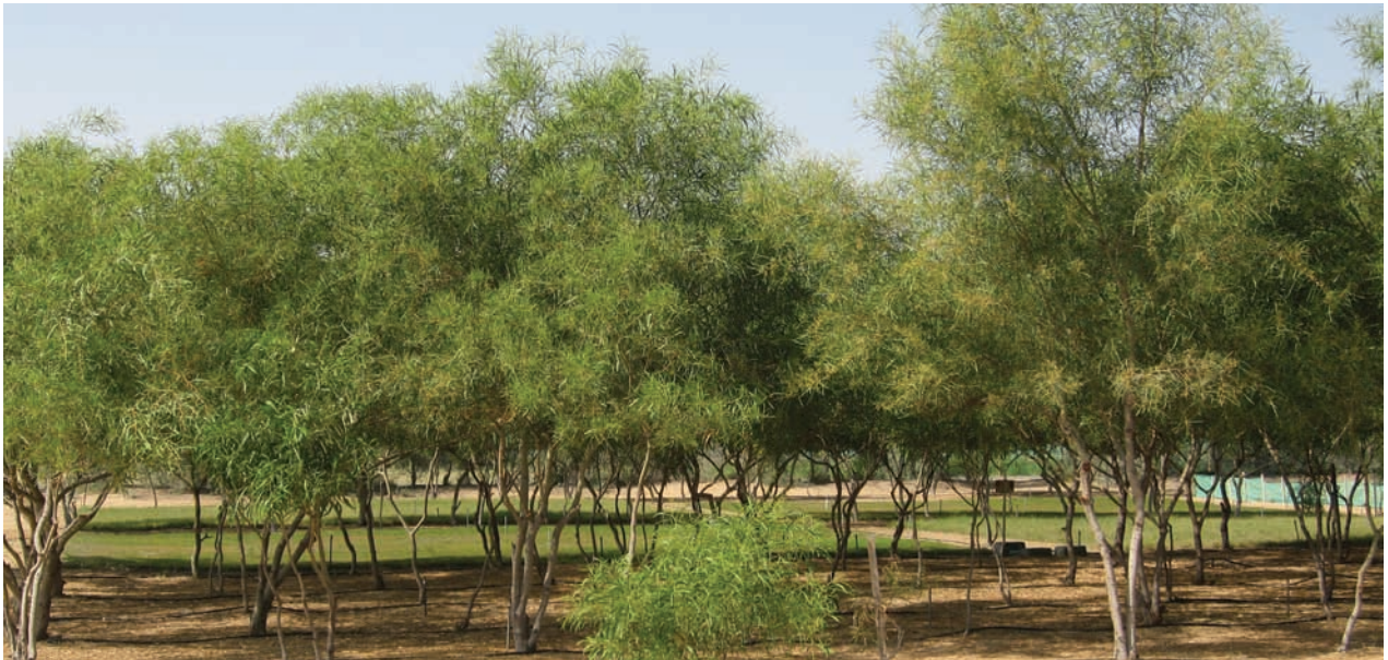
Agroforestry system improves farm productivity

conducive to under-storey plants. ICBA's research over the last six years has demonstrated the compatibility between A. ampliceps to two salt-tolerant grasses, Sporobolus arabicus and Paspalum vaginatum , in response to different salinity treatments and fertilizers.