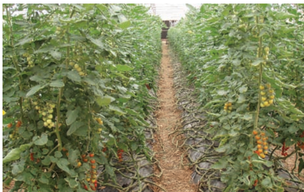
Use of RO plant in UAE farms could be directed to grow high value cash crops in green houses

With advanced treatment and management, recycled water could be a reliable long-term water resource: for agriculture; in the landscaping and forest sectors, where the current reuse practice should be continued; in commercial floriculture which also offers a new dimension for profitable recycled water; in industry for such purposes as processing, washing, and cooling in facilities that manufacture products; and in groundwater recharge which could be used for both groundwater replenishment and salt-water intrusion control by establishing a hydraulic barrier in the coastal areas. In addition, recycled water could also be used as Abu Dhabi's strategic water reserve.