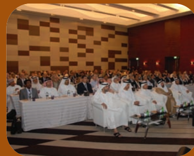
Capacity Building and Knowledge-sharing