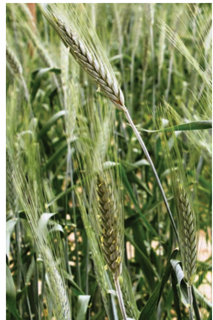
Field screening of barley (left) and Triticale (right) genotypes