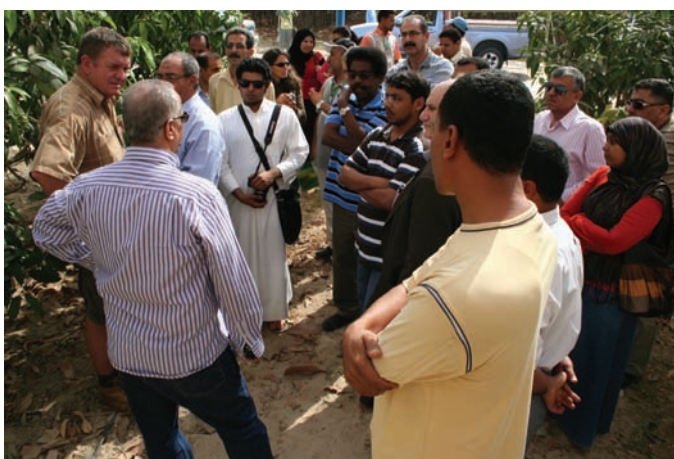
Participants of the training workshop in Egypt visiting a private agricultural farm