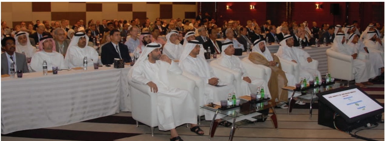
Participants at the International Soil Conference in Abu Dhabi