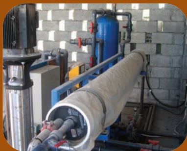
Integrated Water Resource System