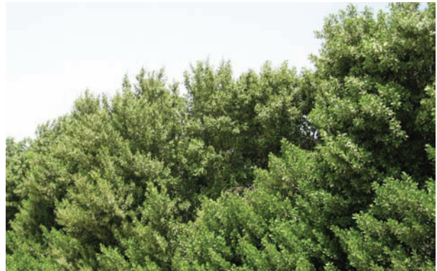
Use of brine in landscaping plants (Conocarpus erectus L.) in the central region of UAE

The lack of freshwater resources is a serious constraint to agricultural development in the United Arab Emirates. In inland areas as well as the coastal zone, saline groundwater is available for use in agriculture although it is not suitable for growing cash crops, such as vegetables which are mainly grown in greenhouses. To overcome this problem, about 400 small-scale reverse osmosis (RO) plants are used to desalinate groundwater to produce date palm or cash crops in greenhouses or to supply drinking water to animals and poultry. The use of such technologies requires proper brine concentrate management and disposal practices to minimize groundwater pollution. ICBA was commissioned by the Minister of Environment and Water to undertake a thorough review/analysis to identify suitable environmentally friendly brine disposal options.