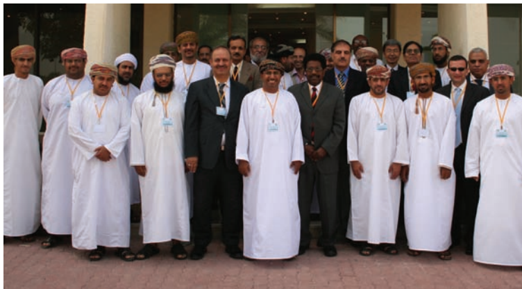
ICBA scientists with their Omani partners

Elsewhere within the region, in Oman, ICBA scientists continued to collaborate with colleagues from the Omani Ministry of Agriculture to formulate national plans (strategic and action) to combat salinity, protect water resources from pollution and salinity and ensure the sustainable development of agricultural systems and the livelihood of farmers. As a result of water depletion and environmental deterioration, agricultural areas in the Batinah coastal plains have suffered from decreasing productivity, salinization of groundwater and intrusion by sea water. The combination of these factors has led to a dramatic deterioration and depletion of natural resources impacting severely the livelihood of farmers dependent on agriculture in the region.