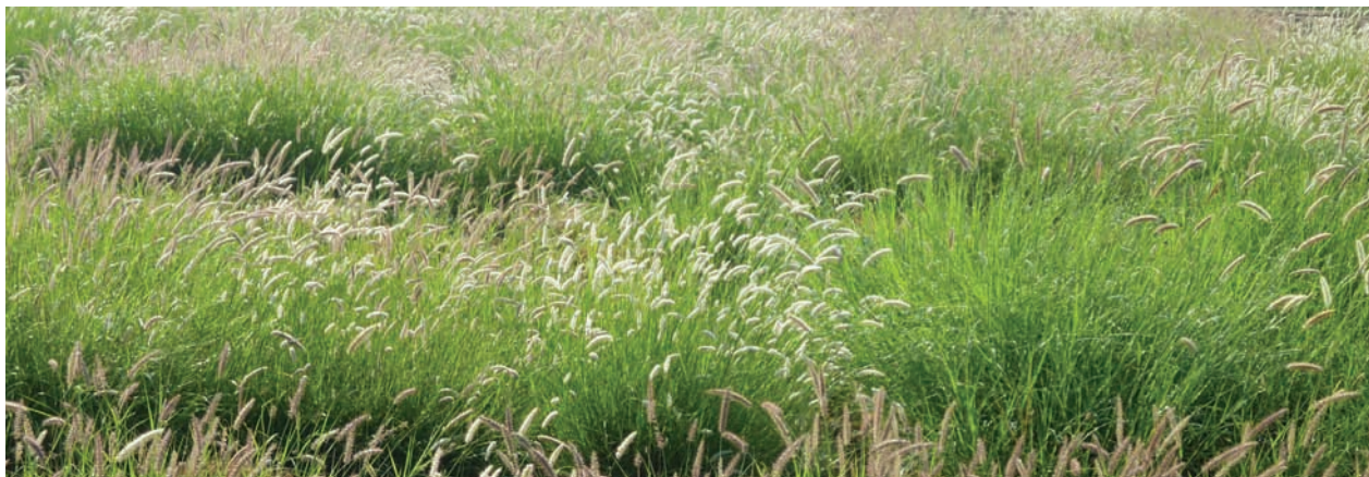
Buffel grass experiments at ICBA Research Station

During 2010 NyPa grass was grown at different salinity levels (15, 25 and 40 dS m -1 ) and irrigation treatments (ET 0 x1, ET 0 x1.25 and ET 0 x1.5). Biomass from three harvests showed maximum dry biomass of about 23.69 t/ha, at irrigation salinity of 25 dS m -1 and ET 0 x1.5. This is comparable to the values