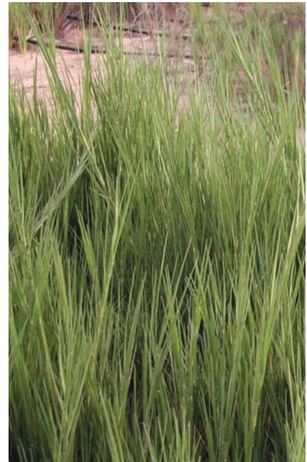
High growth of NyPa forage

As well, the genotypes of Triticale ( x Triticosecale ), a hybrid of wheat and rye, were screened and selected for salinity tolerance and dry matter production. Most triticales that are agronomically desirable and breed true have resulted from several cycles of improvement. The use of triticale is increasing as it is an important feed crop for cattle, swine and poultry and can be used as an alternate for corn and soybean. Forage yield and quality of triticale is comparable to barley and oat. Recently farmers grew peas with spring triticale for silage. During 2010, when 37 accessions were evaluated under field conditions at three salinity levels, accessions exhibited a wide range of genetic variability for dry matter and grain yield. Many accessions have the potential to be used for dry matter and/or grain production across salinity levels.