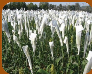
Marginal Quality Water Resources