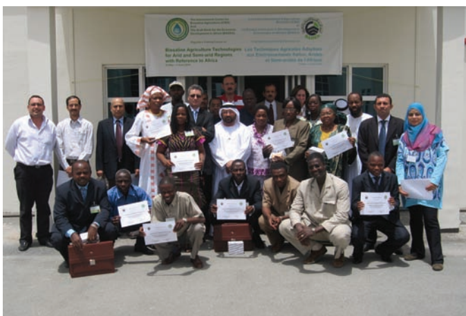
Participants of the BADEA training course