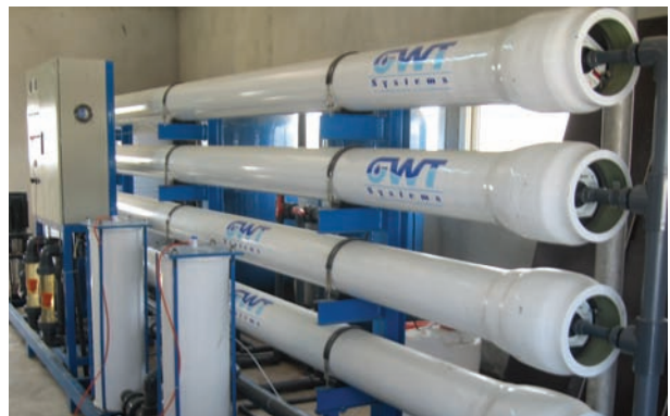
Small RO plants used at farm level

The methods of brine disposal include surface disposal (to excavated/non-excavated pits, mountain terrain or steep edge of sand dunes), which is the most common practice (>50%) in the selected sites followed by well injection or dug well (>13%). Other disposal methods are a pipeline to the sea; the