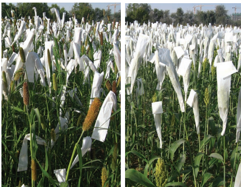
Field screening of pearl millet (left) and sorghum (right) genotypes

ICBA research into high-yielding grain and forage lines of pearl millet and sorghum for enhanced crop-livestock productivity in saline lands: phase II continued in 2010 with 35 genotypes of pearl millet being received from ICRISAT and evaluated under field conditions at three salinity levels. Forty-eight mini-core collection of sorghum were evaluated at three salinity levels under field conditions. This research followed earlier identification of suitable germplasm for marginal environments of WANA through screening, evaluation and selection of suitable germplasm and the